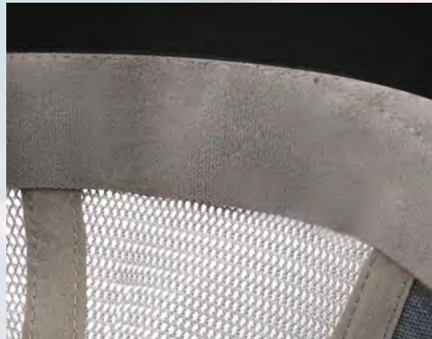
ELASTICIZED COMFORT SWEATBAND