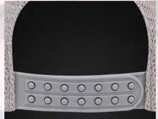
DOUBLE ROW SOFT PLASTIC BACK STRAP